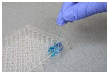
Sampling by using capillary