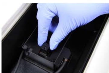
Setting capillary jacket into cell holder