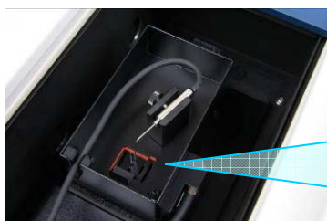
Setting temp. sensor and capillary into jacket