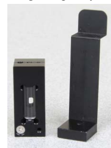
Fig.2 Capillary jacket (L) and Adaptor (R) for melting measurement.